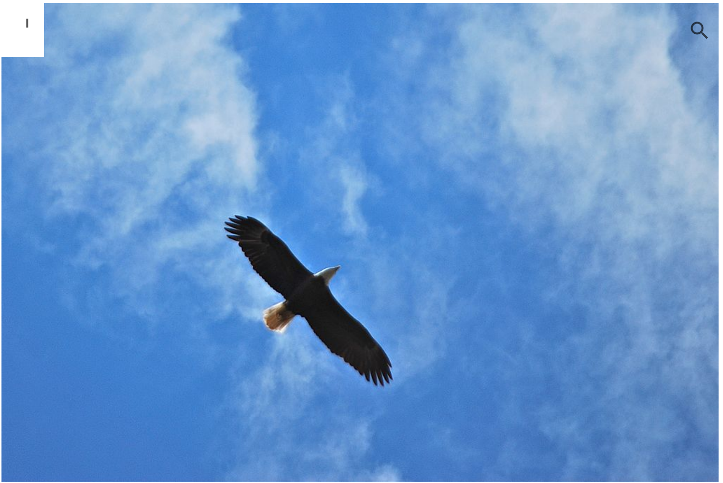
Figure 3. Your project can soar to new heights with the right scaling strategy

Scaling in the context of social projects and businesses means making something bigger. This involves making changes to your project so that it reaches more people or has a larger impact. Sharing your project and ideas is a key part of scaling; without sharing, scaling cannot happen.